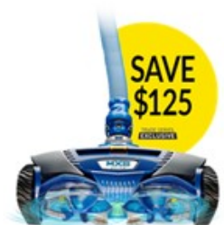
Zodiac MX8™ Elite