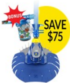
Zodiac T5 Duo®