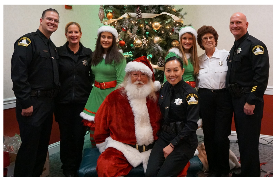
More pictures at \underline{www.cvipssa.com}