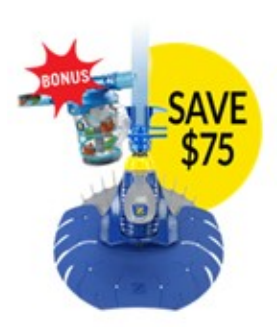
Zodiac T5 Duo®