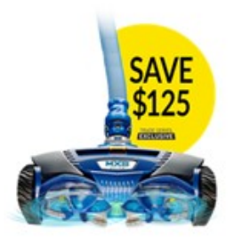
Zodiac MX8™ Elite